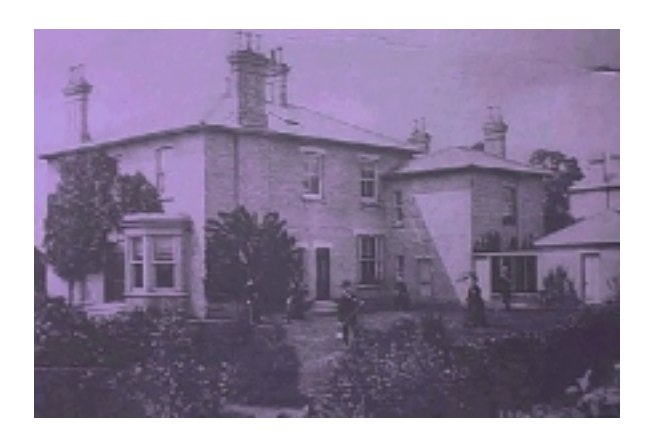
57a London Road (circa 1900)