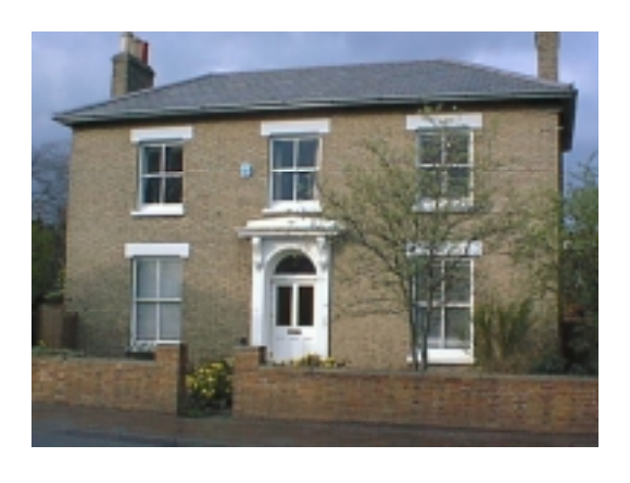
59 London Road